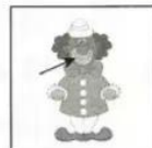
第 2 题图

2. Look at the clown (小丑). His m _____ is big.