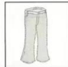
第 4 题图

3. Bobby, save your m _____ for a rainy day.